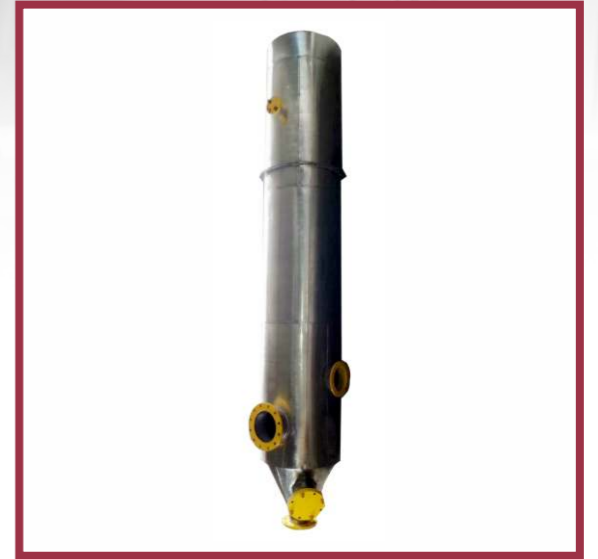
DIRECT CONTACT HEATERS