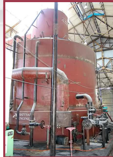
BATCH VACUUM PAN