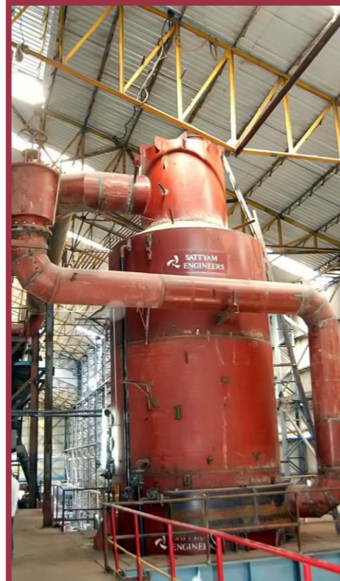
ROBERT EVAPORATOR BODIES