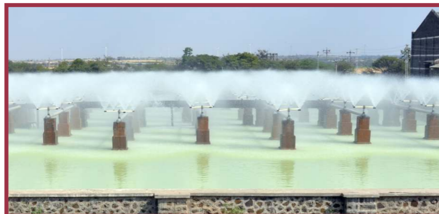
MIST COOLING SYSTEM