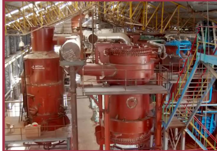
BOILING HOUSE MODIFICATION